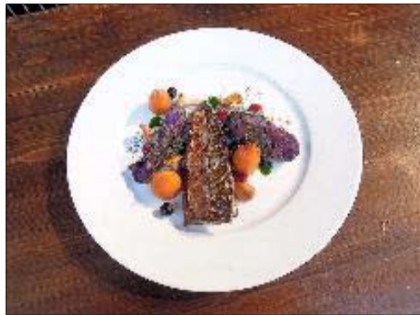
... and the dish he produced.