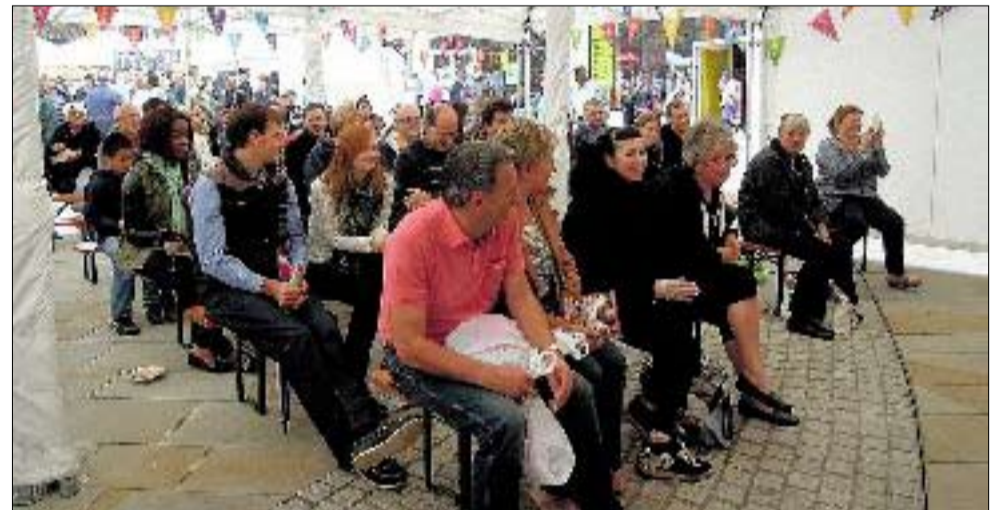
... watched by an appreciative crowd.