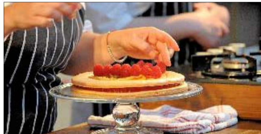
Delicious creation at work on the Tante Marie Academy Theatre.