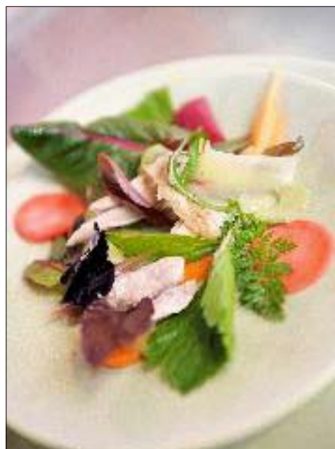
Pickled Quail with Pumpernickle Toasts.